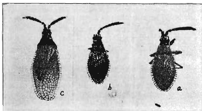
Fig. 2. a , Alveotingis grossocerata Osb. & Drk.; b , A. minor n. sp.; c , A. brevicornis n. sp. (Photo by Carl J. Drake).

Described from a macropterous male, taken at Ames, Iowa, June 14, 1897, by the senior author. It is closely related to A. grossocerata , but readily differentiated from it by the characters given in the key.