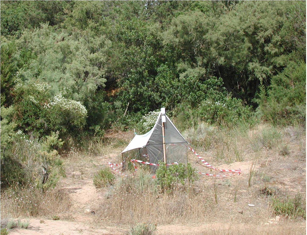
FIGURE 11. The Malaise trap on the shore of Lake Baratz in 2002.