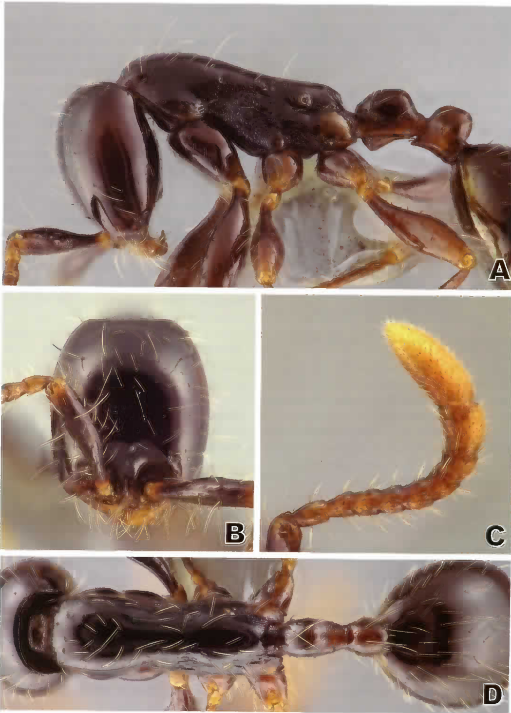
Figure 1. Aenictus leptotyphlatta sp. nov., worker. A, Body in profile; B, Head in full-face view; C, Antenna; D, Body in dorsal view.