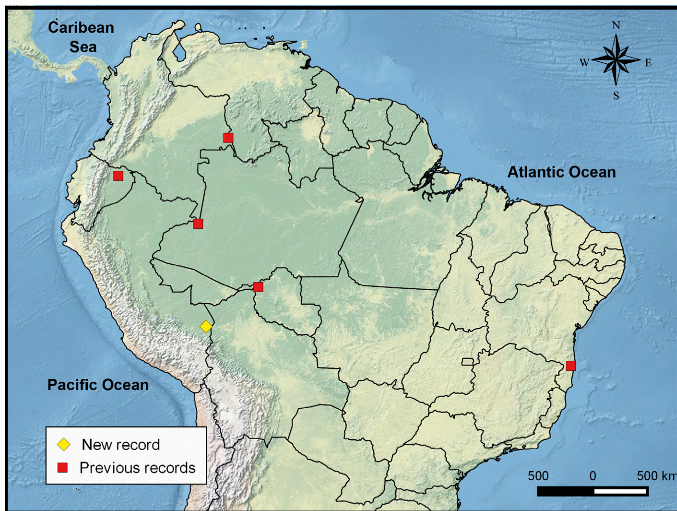
Figure 1. Distribution of Kempfidris inusualis in South America.