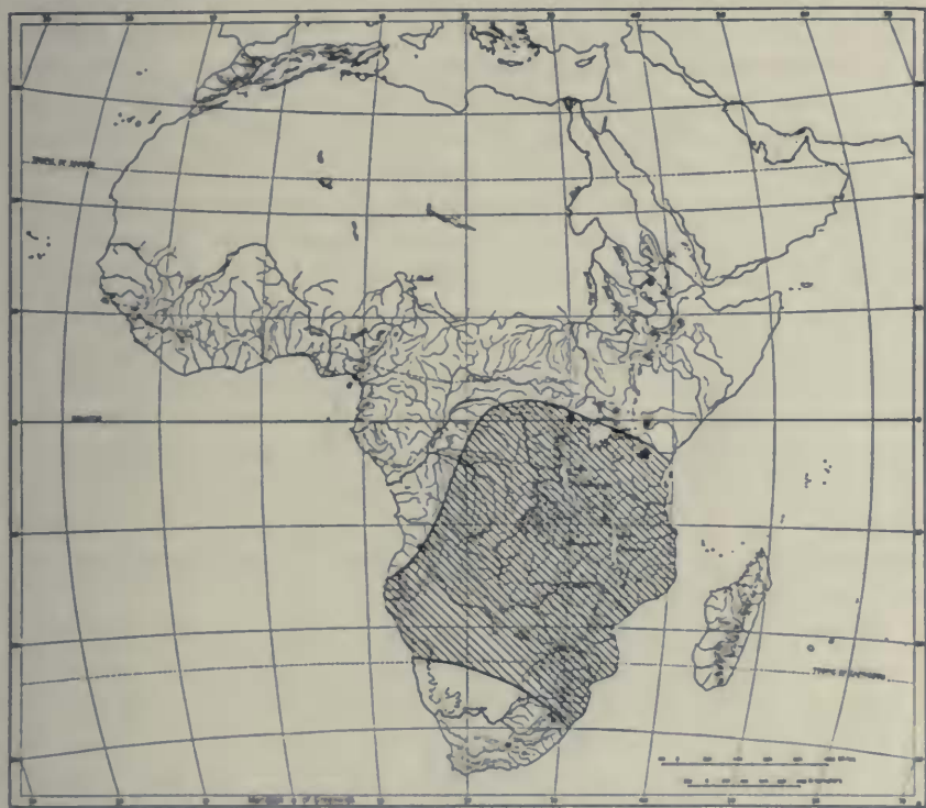
Map 2. Distribution of Semonius in Africa. This genus has recently been recorded from the Indomalayan Region (Singapore).

A negative peculiarity of considerable interest in connection with the subfamily Dolichoderinae is the complete absence in Africa south of the Sahara of Dolichoderus , which is so well represented in the Indomalayan, Australian, and Neotropical, and even by a few species in the Palearctic and Nearctic Regions. On the other hand, Africa possesses one endemic genus, Engramma . A species of the genus Semonius (Map 2) which was supposed to be peculiar to Africa, has recently been