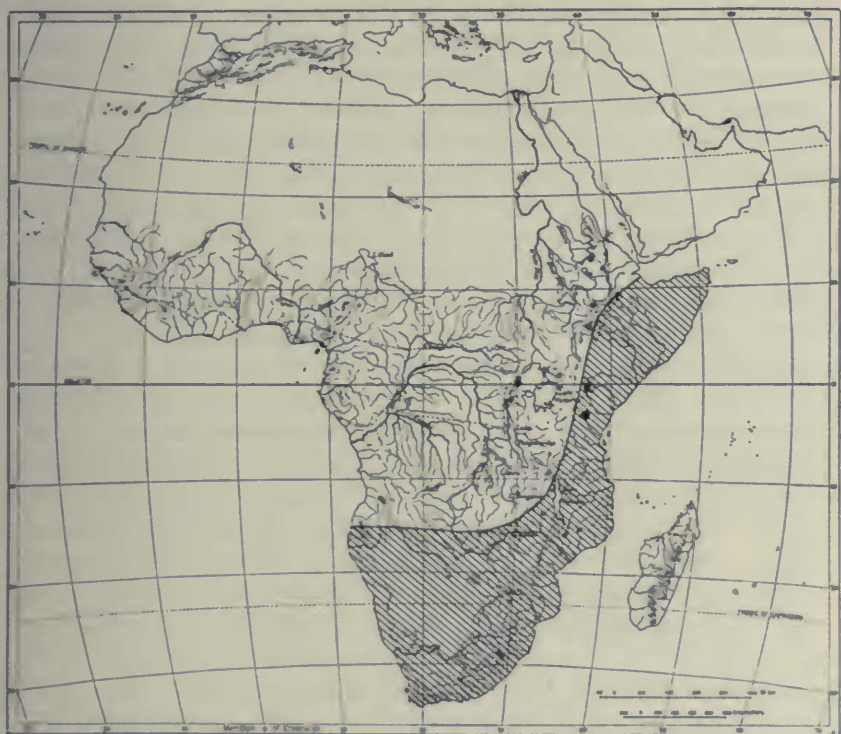
Map 3. Distribution of Ocymyrmex , a genus peculiar to the dry savannahs of East and South Africa.

The problem of the altitudinal distribution of the Formicidæ in the Ethiopian Region is peculiarly interesting in connection with the circumpolar fauna and the montane faunas in other parts of the World. As there is no general account of the subject, Dr. Bequaert, who collected on Mt. Ruwenzori, has written out for me the following sketch of what is known of the ant-faunas of this and the other high mountains of tropical Africa.